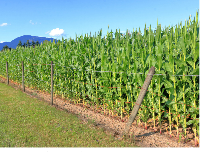
A successful thick crop of sweet corn stands in a tall, straight, dense row and will soon be harvested for market.

Until recently, however, cellulose—both its structure and how plants make it—was a mystery. That's why the U.S. Department of Energy's Office of Science funded an Energy Frontier Research Center (EFRC) to explore the topic and its implications for advanced plant-based materials and biofuels. The Center for Lignocellulose Structure and Formation included a dozen principal investigators spread across a number of universities, including physicists and engineers as well as plant biologists.