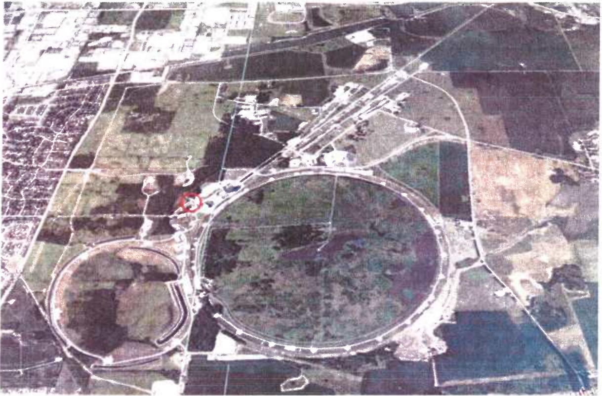
Figure 2 The Fermilab Muon Campus including the Mu2e Facility, the MC-1 Building, the Muon Campus Beamline berm, and the former Antiproton Facility Buildings (AP-30, AP-10, and AP-50)