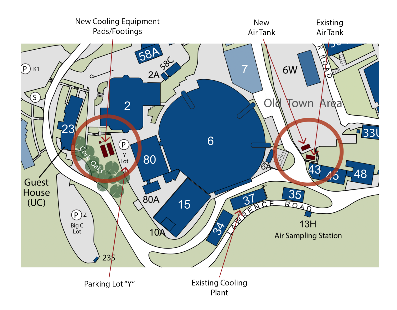
Figure 2: Project Site