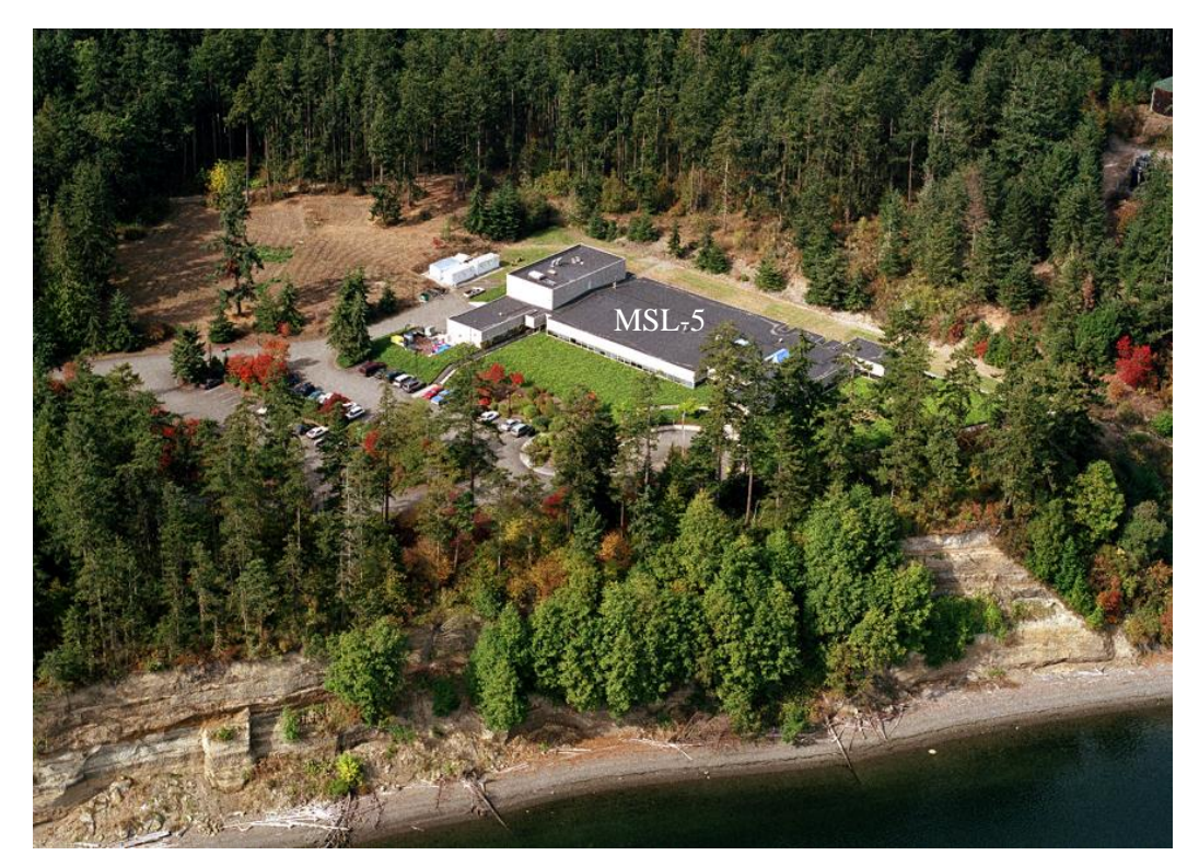
Figure 1.4. MSL-5 Building