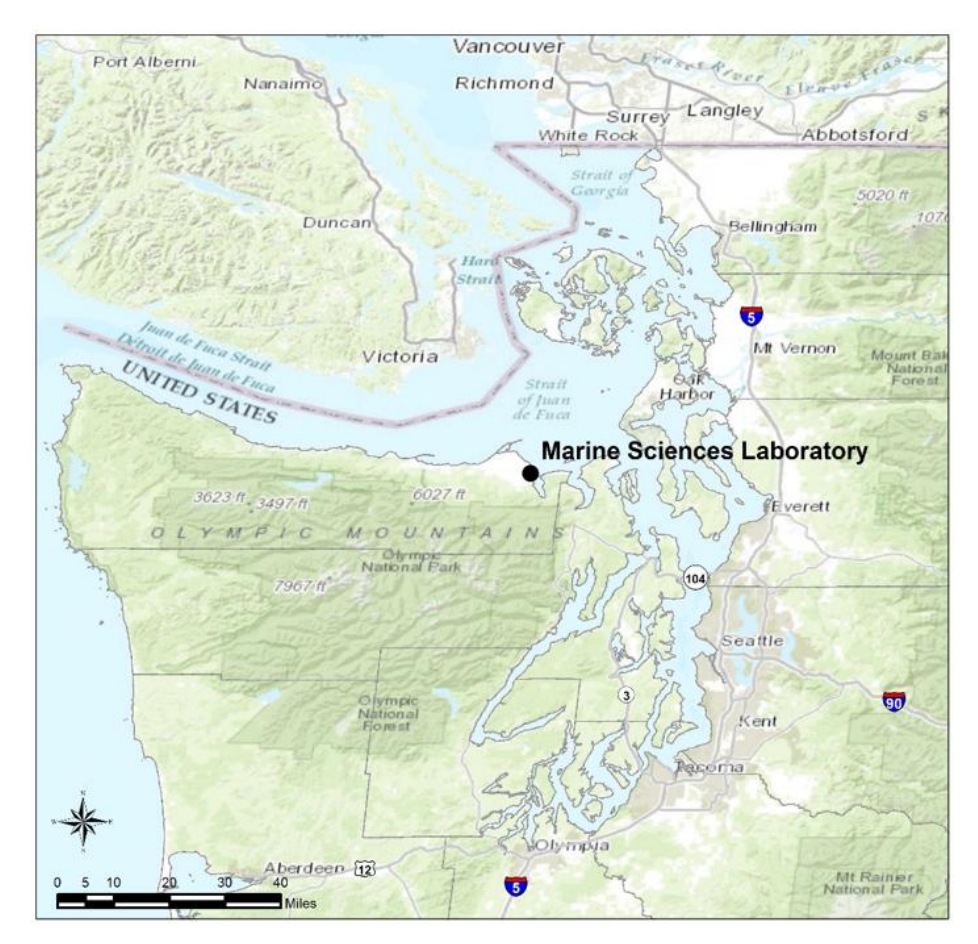
Figure 1.1. MSL in Northwestern Washington State

This radiological air emissions report meets the Washington Department of Health (WDOH) requirements for radiological National Emission Standards for Hazardous Air Pollutants (NESHAP) compliance reporting for the activities at MSL for calendar year (CY) 2018. The WDOH Radioactive Air Emissions License (RAEL)-014, Renewal 1, was issued in January 2018. This renewal changed the release to a single, fugitive site-wide emission unit. Compared to the prior year, radiological laboratory activities have not changed under the new license.