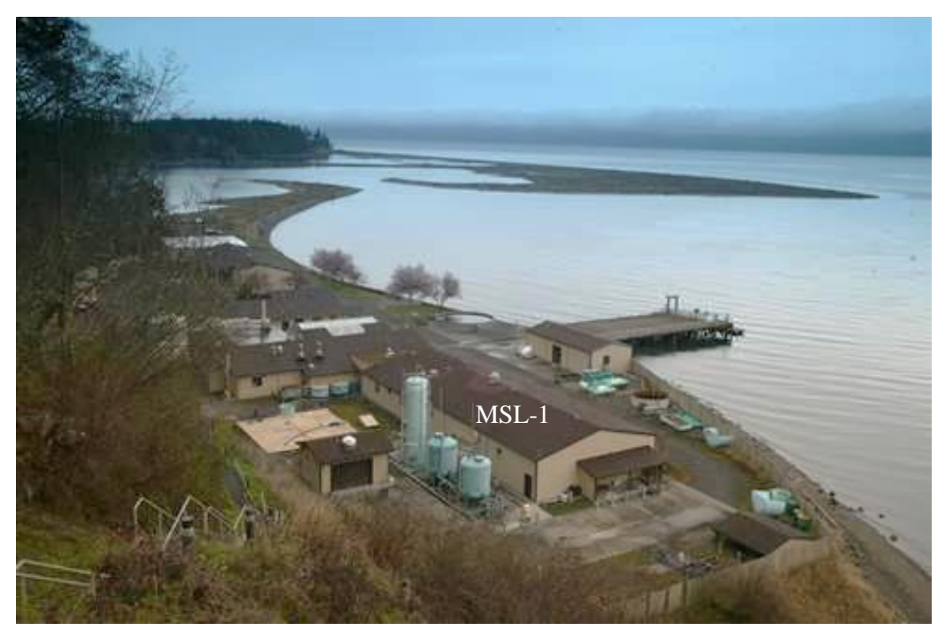
Figure 1.3. MSL-1 Building